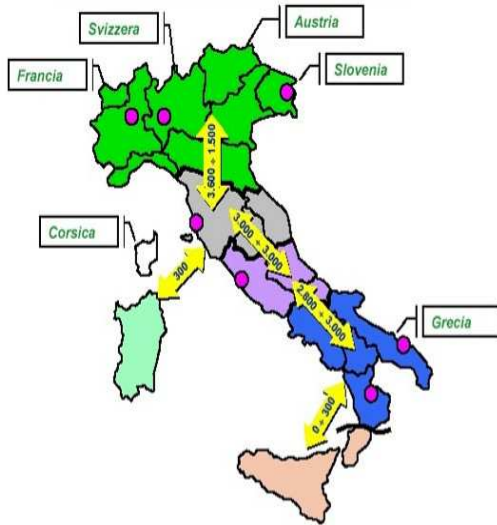
Fig. 3. Transmission capacity between the geographic zones and border connections

divided into geographic zones that are connected by a limited transmission capacity which often causes congestion problems (Figure 3).